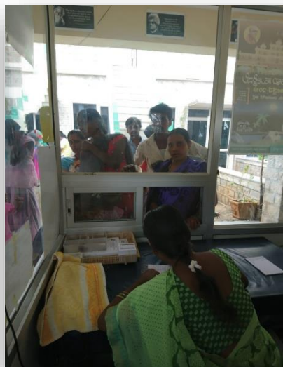
Recording of the children in the reception of France India Karnataka General Hospital d' Halligudi.