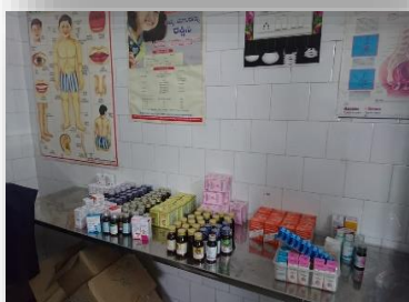
Drugs installation and banner of the camp.